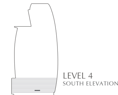
LEVEL 4 SOUTH ELEVATION