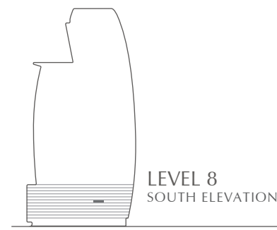
LEVEL 8 SOUTH ELEVATION