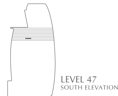
LEVEL 47 SOUTH ELEVATION