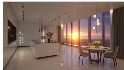
The kitchen.