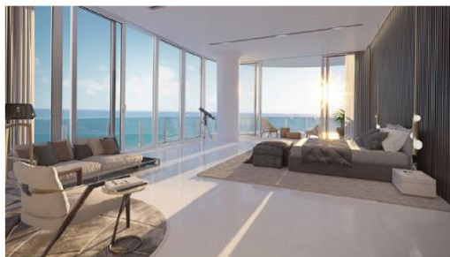
A bedroom in one of the penthouses.

The curvaceous 66-story skyscraper at 300 Biscayne Bay Blvd. has revealed seven penthouses (out of a final total of 391), starting on the 56 th floor, and 38 smaller "Line 01 Signature Residences", which start on the 15 th floor. The penthouses, two of which have already sold, are a minimum of 8,800 square feet in size, and range in price from $16.7 million to $25 million. The lower-floor apartments, which all face the ocean, start at a still-generous 3,600 square feet and a $5.525 million price tag, and come with access to the building's members-only community.