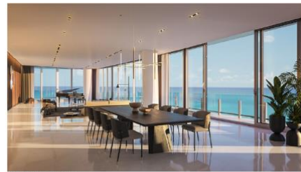
The penthouse dining area.

Check out more images of the penthouses below: