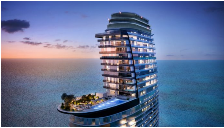
Aston Martin Residences