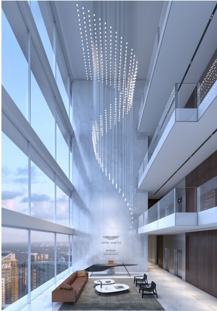
Aston Martin Residences