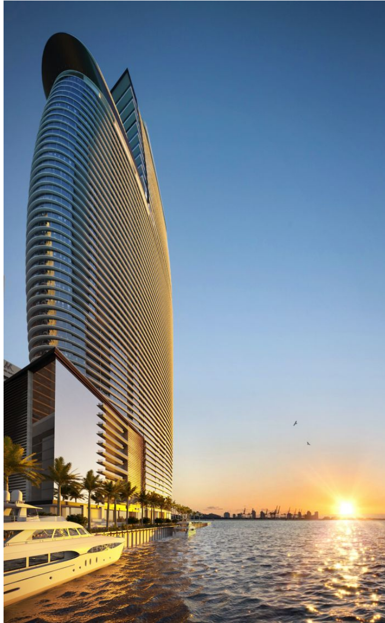
Aston Martin Residences